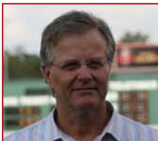
Bill Mott has saddled three winners in the Bourbonette Oaks, the filly counterpart to the Lane's End, but earned his first Lane's End win in 2009 with Hold Me Back.