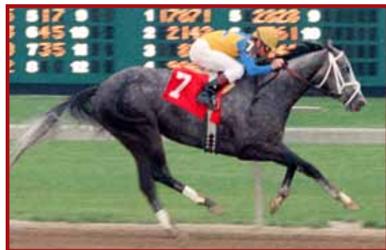
1988 champion 3-year-old filly and Kentucky Derby winner Winning Colors, one of just three fillies to win the Run for the Roses, earns her final career stakes, the Turfway Budweiser Breeders' Cup on October 2, 1989.