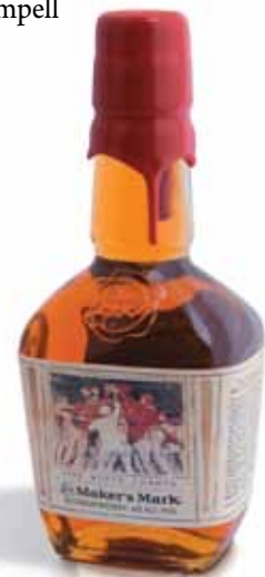
The Maker's Mark Lane's End Stakes commemorative bottle featured the 1990 World Champion Cincinnati Reds.